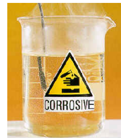
Long time dipping in corrosive liquids