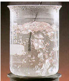
Direct temperature Measurement of hot liquids

It also finds applications for temperature measurement in automobile or other vibrating machinery. It can also be used as a sub-assembly for low temperature resistance temperature detector assemblies.